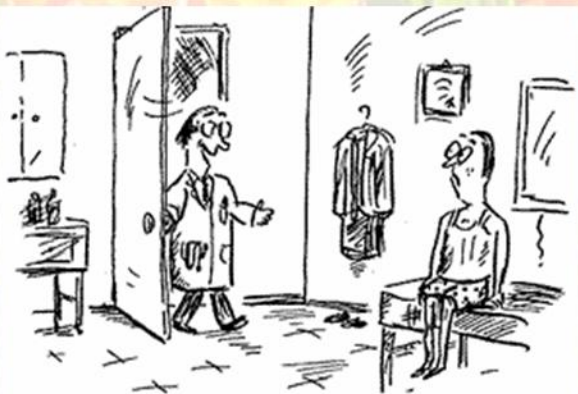
"Let the healing begin!"

With much thanks to our advertising agency, Campbell, Harrington and Brear of York, we are pleased to announce the completion of our new, updated website, www.micmri.com . We wanted to make an informative and useful site that made sense for our referral offices. Now you can review our privacy policy on-line, download a printable referral sheet, review our list of indications for new studies, such as cardiac MRI, breast MRI, and abdominal MRI, captured with our latest software advancement, GE's LAVA (Liver Acquisition and Volume Acceleration). Most importantly, both physician and patient are able to fill out on-line surveys, so that we may take care that we are providing the best possible service for both our referrers and the patients that count on us to take care of them.