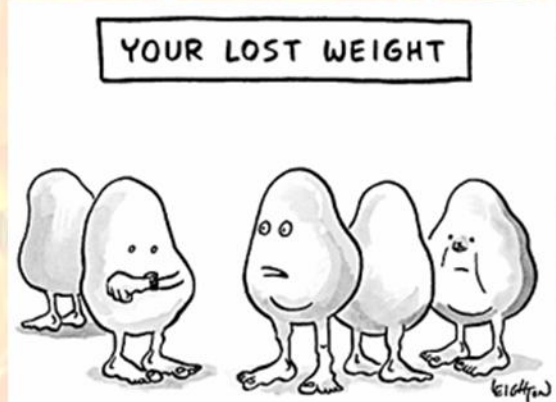
"Ready to head back?"

A distraught man ran into the doctor's office. "Doc!" The man screamed, "I've lost my memory!" "When did this happen?" asked the doctor. The man looked at him and said, "When did what happen?"